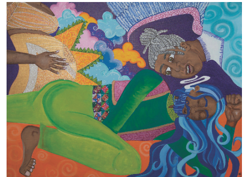
"In Too Deep" by Nicolette Faison